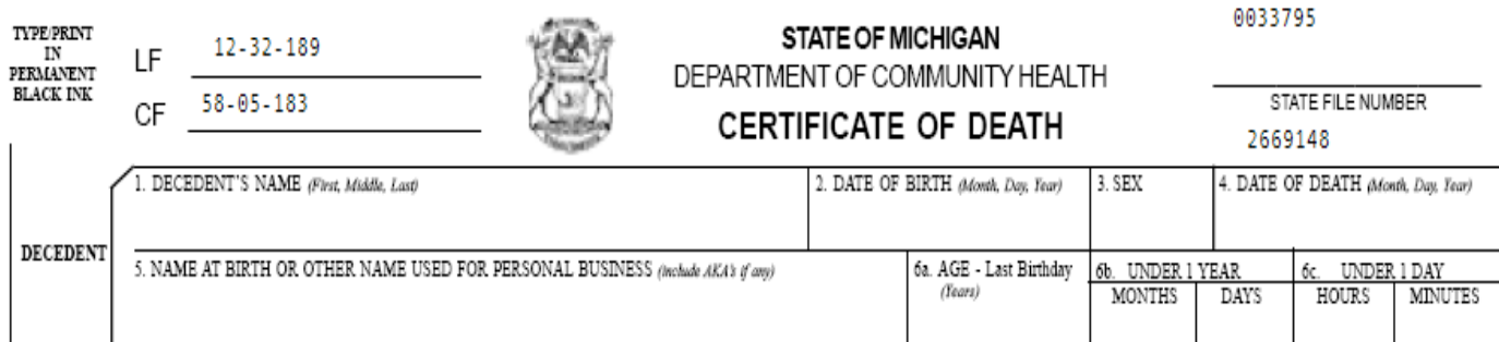
Figure 3 Each form is assigned a press number (2669148) and is unique to each form. If the state file number or the local file number are not available, the press number may be used. The press number would be recorded as 669148 .