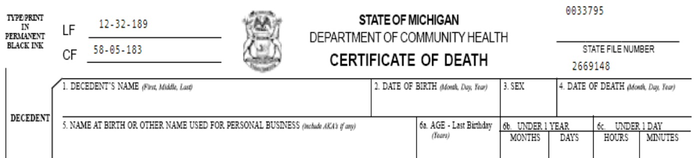
Figure 2 The LF number or 'local file' number is to be used as the second best choice. The local file number (12-32-189) will actually be recorded as 232189 .