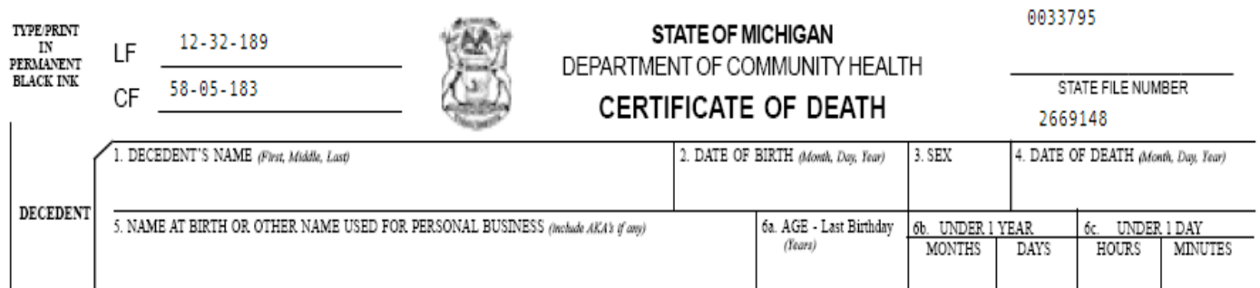
Figure 1 Record the state file number in the upper right hand corner (0033795) using the last 6 digits. The number will actually be recorded as 033795 . Recording this number is the preferred number and should take precedence over all other numbers.

Recording the Death Certificate Number: See specific instructions below.